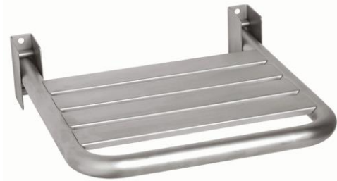
AM0201CS Satin finish