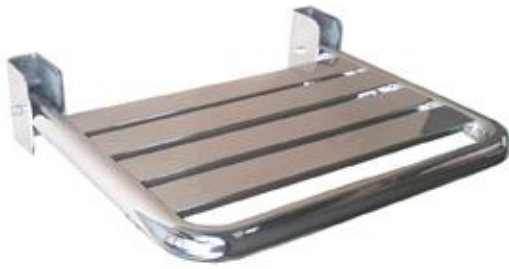
AM0201C Bright finish