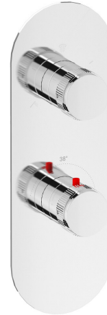
Plate and handles trimkit