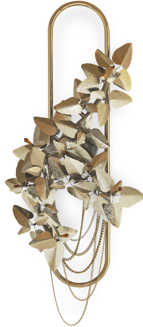
MCQUEEN II | wall