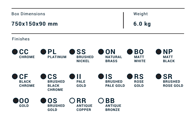
Plate and handles trimkit