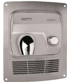
KT0005CS Satin finish