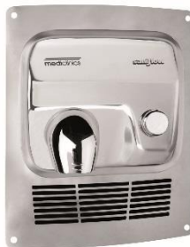
KT0005C Bright finish