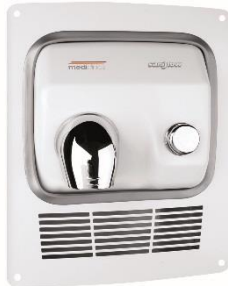
KT0005 White finish