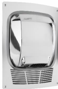
KT0010C Bright finish