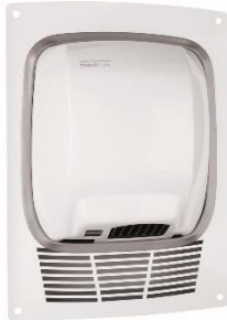
KT0010 White finish