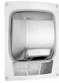
KT0010CS Satin finish