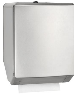
DT0208ACS Satin finish