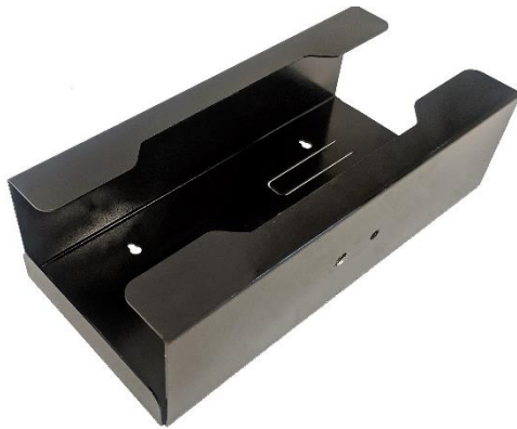
KG0020B Matte black epoxy finish