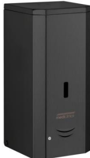
DJ0037AB Matte black epoxy finish