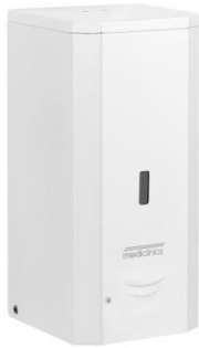
DJ0037A White epoxy finish