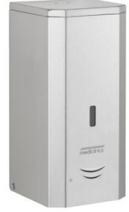
DJ0037ACS Satin finish