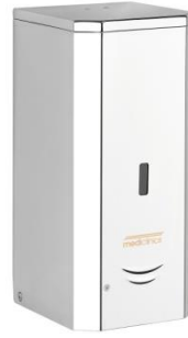
DJ0037AC Bright finish