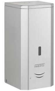
DJS0039ACS Satin finish