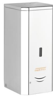
DJS0039AC Bright finish