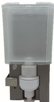
DJSM0039A Satin finish body