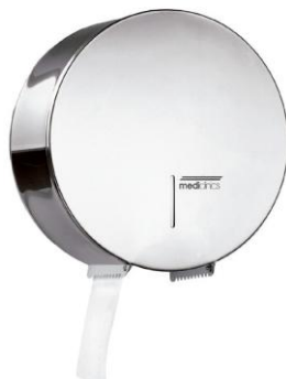
PR0783C bright finish