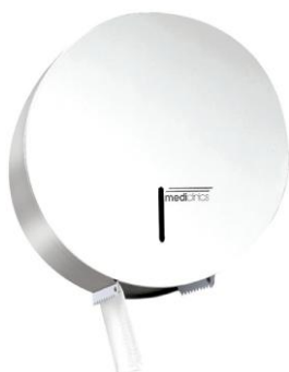
PR0787 White epoxy finish