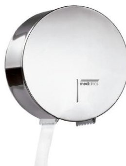
PR0787C bright finish