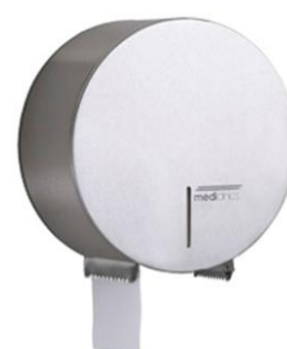
PR0787CS satin finish