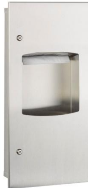
DTE0030CS finish satin