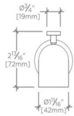
FRONT VIEW SCALE: 3"=1'-0"