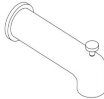
ISO VIEW SCALE: 3"=1'-0"