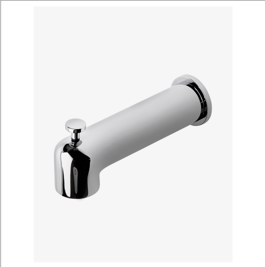
SHOWN IN DECIBEL WALL MOUNTED TUB SPOUT WITH DIVERTER| DBTS01

Decibel Wall Mounted Tub Spout with Diverter