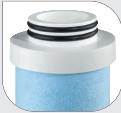
BX Quick-fit configuration with 45 mm double o-ring collar. Fit to Plus 3P BX housings, DP housings, K DP housings, Depural® Top, Bravo DP, Oasis DP.