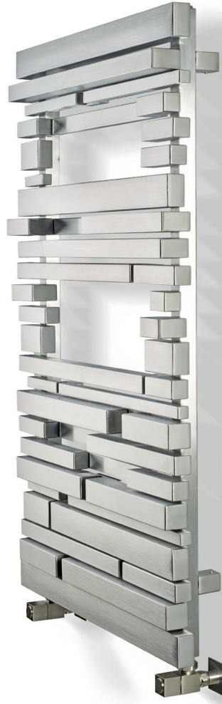
1000 x 600 in brushed finish shown with Azur valves