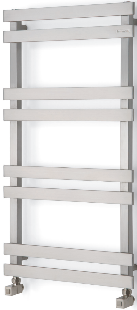
900 x 500 in brushed finish shown with Azur valves