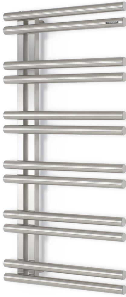
1000 x 500 in brushed finish