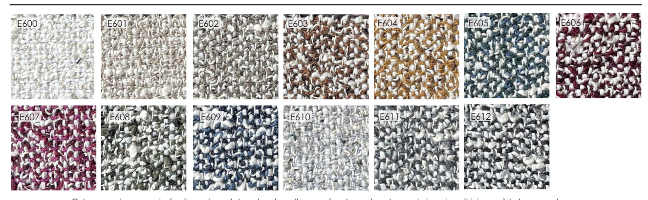
Colour samples are an indication only and do not replace the use of real samples when ordering, since it is impossible to guarantee a screen reproduction identical to the original.