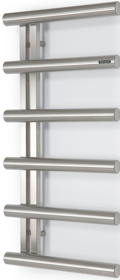
1000 x 500 in brushed finish