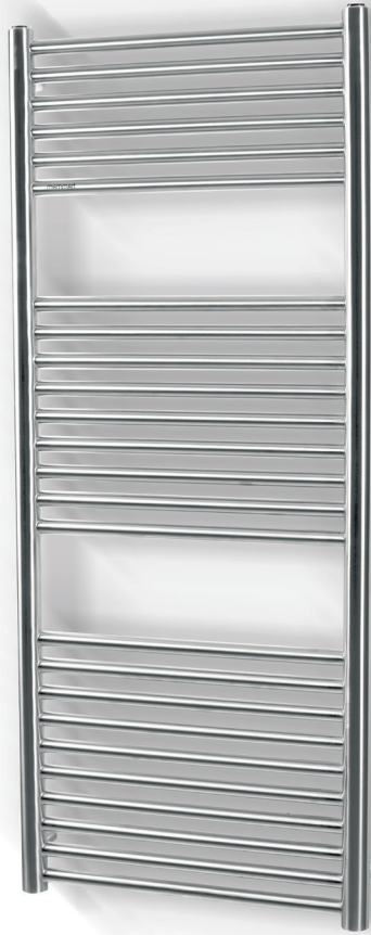
1200 x 500 in brushed finish