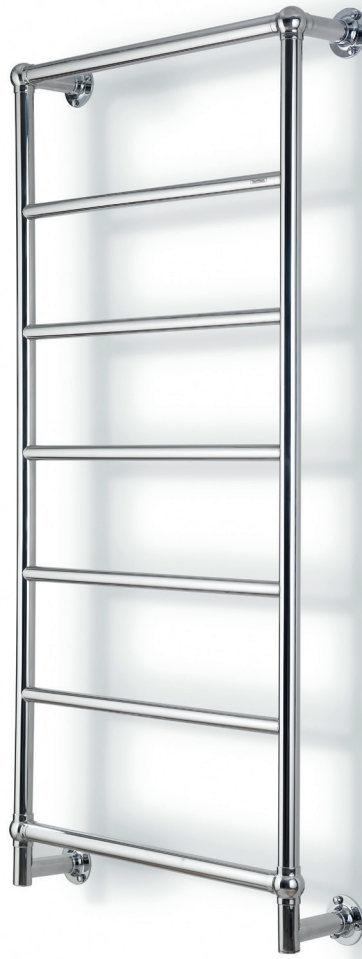
1366 x 667 in polished finish