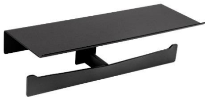
AI2004B Black finish