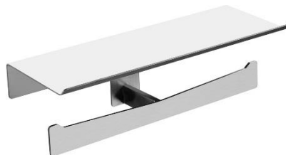
AI2004C Bright finish