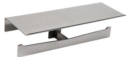
AI2004CS Satin finish