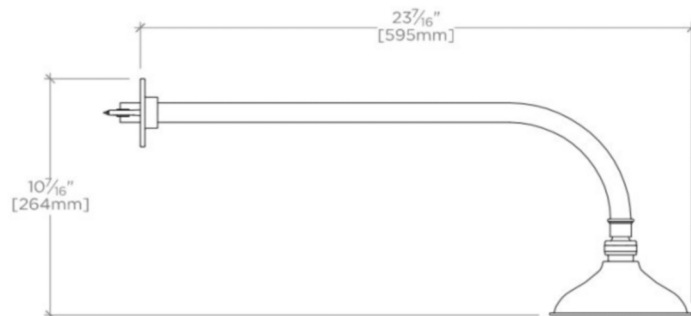
SIDE VIEW SCALE: 1\frac{1}{2}''=1'-0''