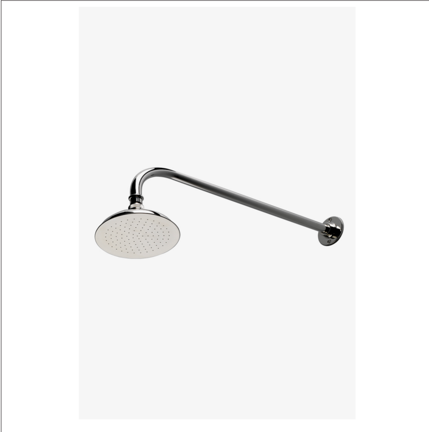
SHOWN IN EASTON CLASSIC 6" SHOWER ROSE| EASH06

Easton Classic Wall Mounted 6" Shower Rose, Arm and Flange