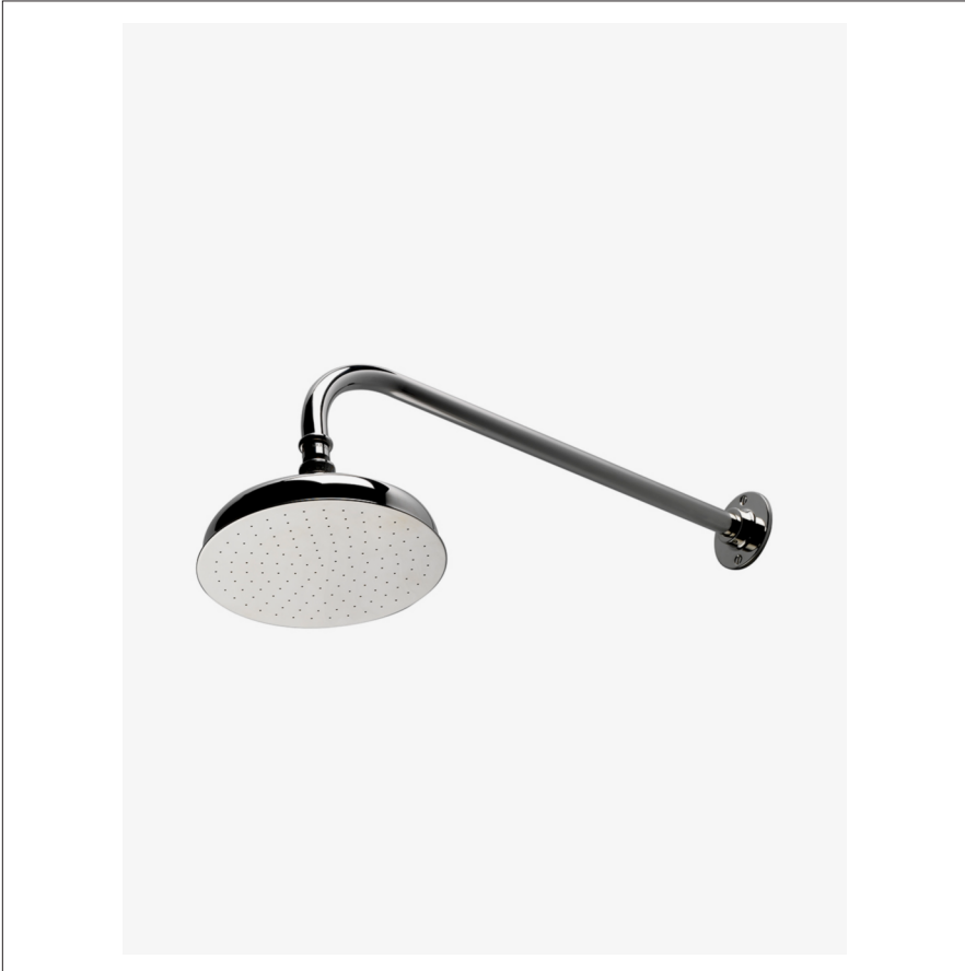
SHOWN IN EASTON CLASSIC SHOWER ARM AND FLANGE| EASH20

Easton Classic Wall Mounted 8" Shower Rose, Arm and Flange