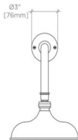
FRONT VIEW SCALE: 1\frac{1}{2}''=1'-0''