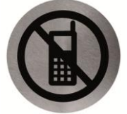
PS0010CS Satin finish