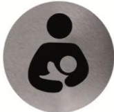
PS0006CS Satin finish