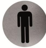
PS0003CS Satin finish