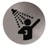
PS0007CS Satin finish