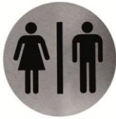
PS0001CS Satin finish