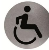
PS0004CS Satin finish