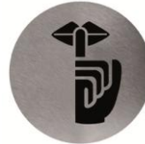
PS0008CS Satin finish