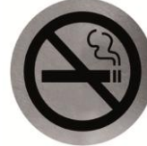
PS0009CS Satin finish