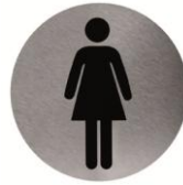
PS0002CS Satin finish