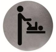
PS0005CS Satin finish