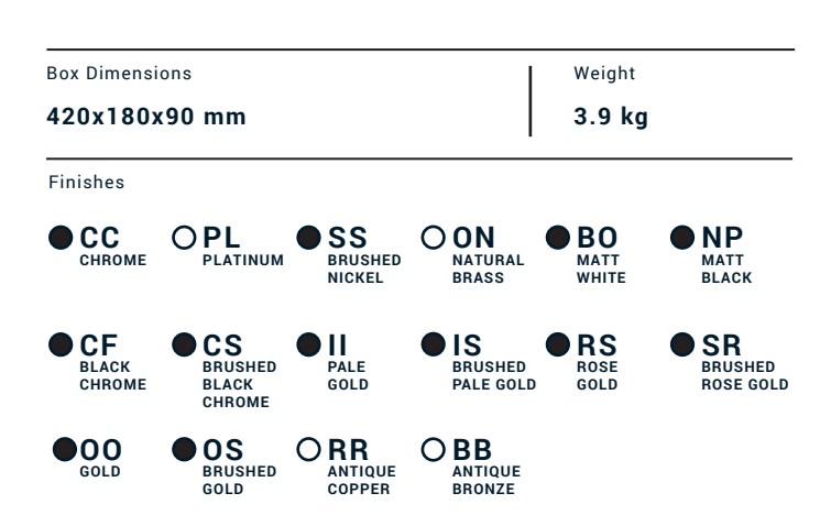
Plate and handles trimkit