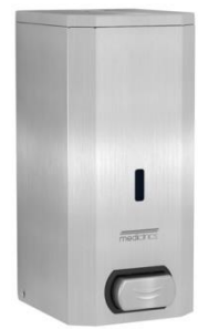
DJS0033CS Satin finish