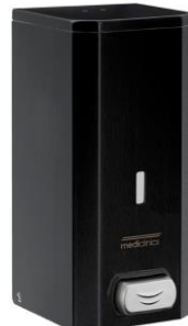
DJS0033B Matte black epoxy finish