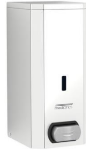
DJS0033C Bright finish