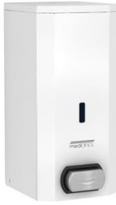
DJS0033 White epoxy finish