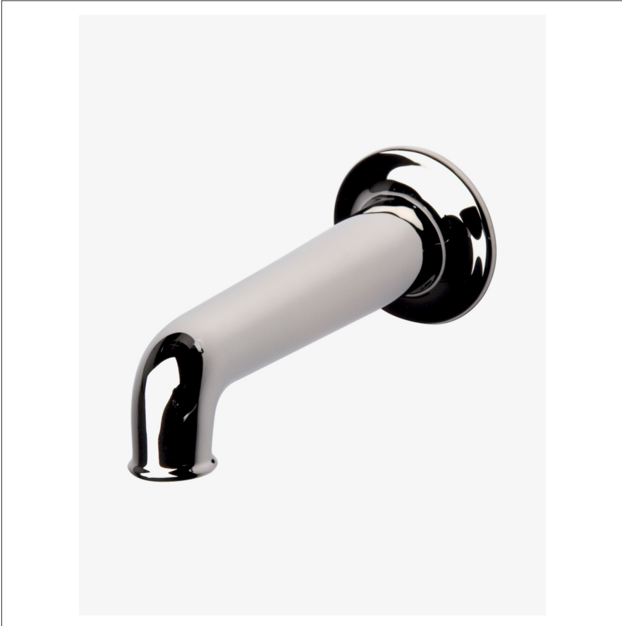
SHOWN IN EASTON CLASSIC WALL MOUNTED TUB SPOUT | EATS82