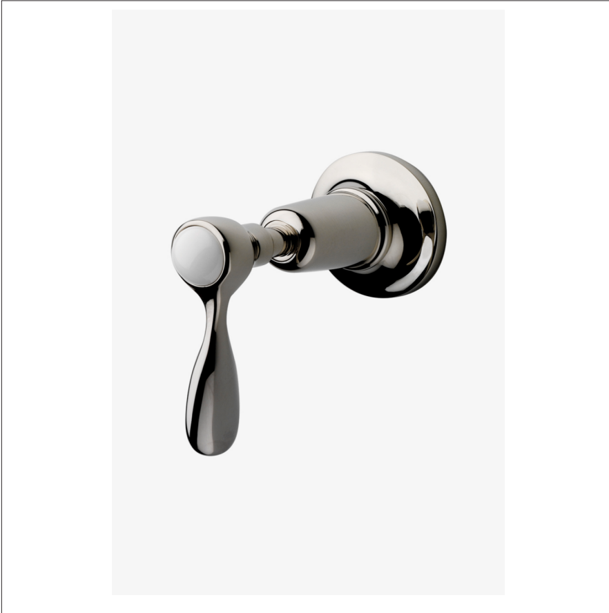
SHOWN IN EASTON CLASSIC VOLUME CONTROL VALVE TRIM WITH METAL LEVER HANDLE| EAVC22

Easton Classic Volume Control Valve Trim with Metal Lever Handle