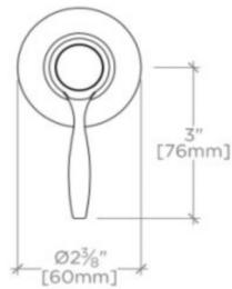
FRONT VIEW SCALE: 3"=1'-0"