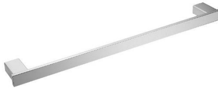
AI1413C Bright finish