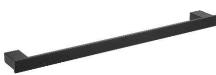
AI1413B Black finish