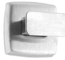
AI0033CS Satin finish