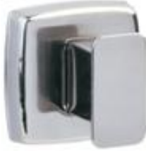
AI0033C Bright finish