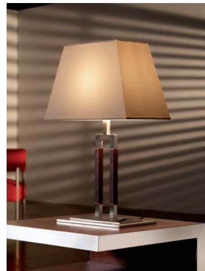
Table lamp with brass structure coated in satin nickel or shiny chrome finish, with optional light or dark leather trim pieces. Rectangular lamp shades are available in linen or cotton.