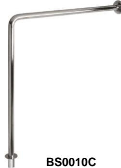
BS0010C Bright finish