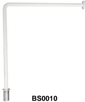
BS0010 White finish