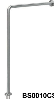
BS0010CS Satin finish