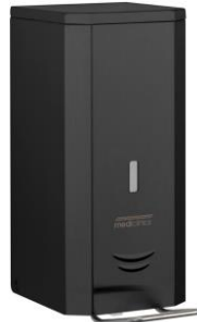
DJSP036B Matte black epoxy finish