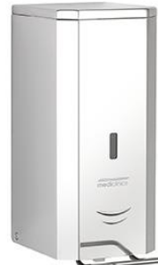
DJSP036C Bright finish