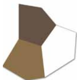
Brown, White and Gold / Marrón, Blanco y Oro REF: 62009