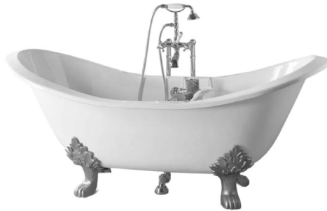
Vasche - Antique - VRG1940