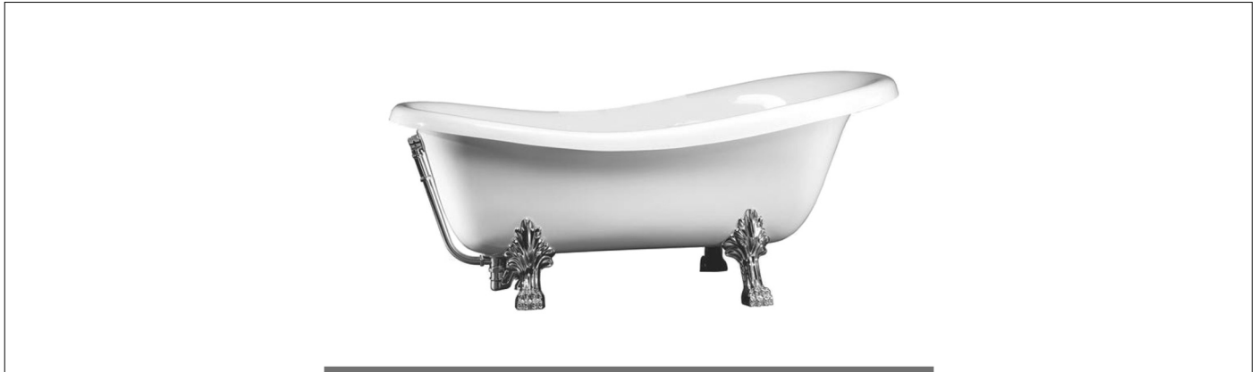
Vasche - Camilla- VGM2220