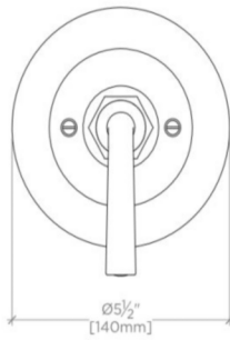
FRONT VIEW SCALE: 3"=1'-0"