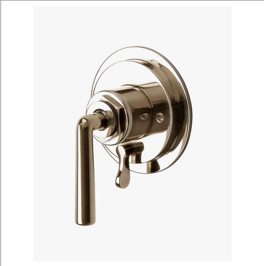
SHOWN IN HENRY PRESSURE BALANCE WITH DIVERTER TRIM WITH METAL LEVER HANDLE | HNPB30