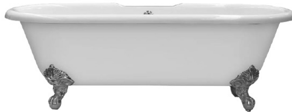
Vasche - Dual 170 2 fori - VRG1910