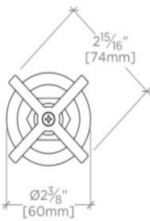
FRONT VIEW SCALE: 3"=1'-0"