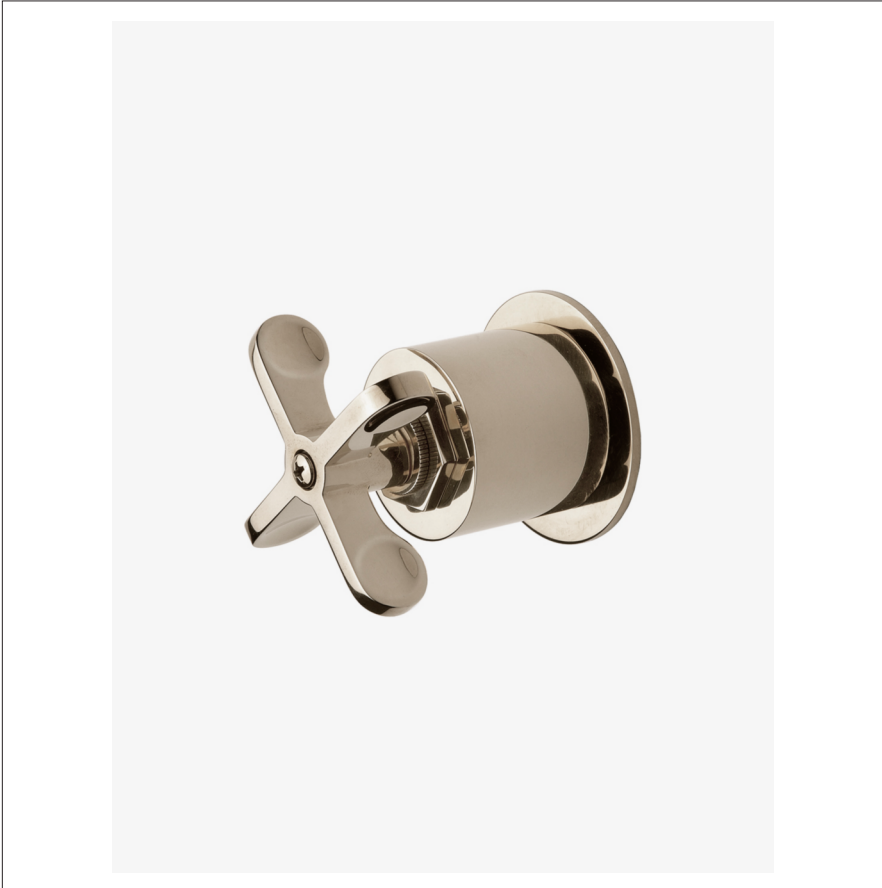
SHOWN IN HENRY VOLUME CONTROL VALVE TRIM WITH METAL CROSS HANDLE| HNVC40