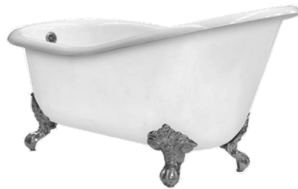
Vasche - Slipper 170 - VRG1925