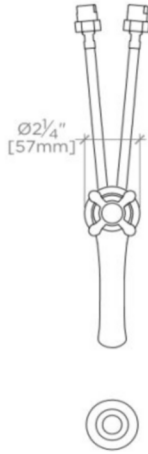
TOP VIEW SCALE: 1/2"=1'-0"

Highgate Low Profile One Hole Deck Mounted Lavatory Faucet with Metal Cross Handles