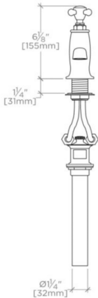
FRONT VIEW SCALE: 1/2"=1'-0"