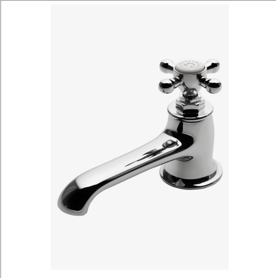
SHOWN IN HIGHGATE LOW PROFILE ONE HOLE DECK MOUNTED LAVATORY FAUCET WITH METAL CROSS HANDLES]