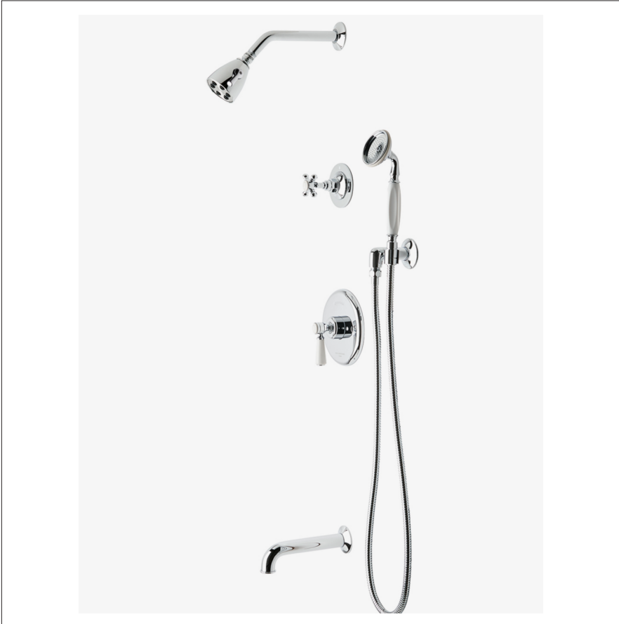
SHOWN IN HIGHGATE PRESSURE BALANCE SHOWER PACKAGE WITH 2 3/4" SHOWER HEAD, HANDSHOWER, TUB SPOUT

Highgate Pressure Balance Shower Package with 2 3/4" Shower Head, Handshower, Tub Spout and Diverter Cross Handle