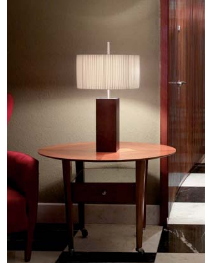
Table lamp releasing diffused light with cherry, wenge or natural wood finishing, complemented with satin nickel trim. Polycarbonate diffuser is included with fixture. Circular lamp shade available in classic cotton, or cream and white translucent hand wrapped polyester blend ribbon. Available in smaller format.