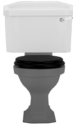
Sanitari e Consolle-London PHLO10