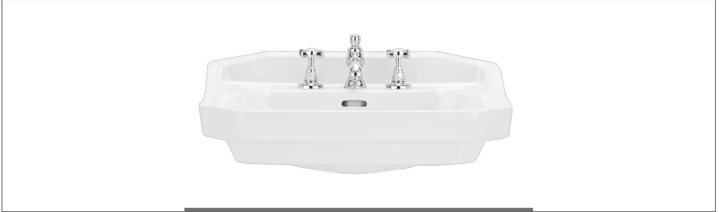
Sanitari e Consolle-London PHLO05