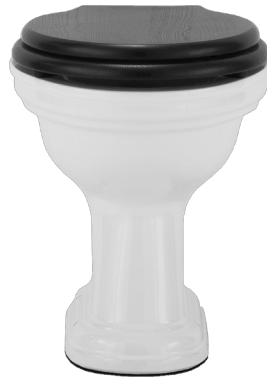
Sanitari e Consolle-Oxford PHOX01