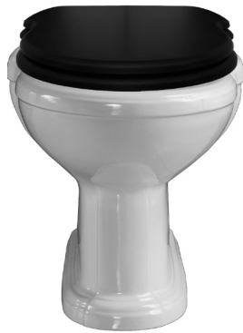
Sanitari e Consolle-Pompei PHPM01